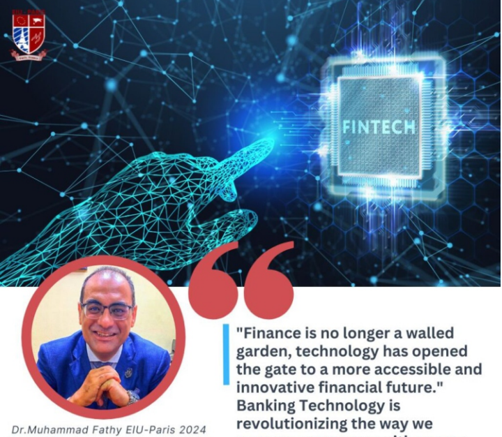
Head of Technology, Banque du Caire Cairo Eqvpt

Professional Doctorate (PD), is a careercentred qualification, designed to recognize and honor outstanding individuals who have made notable contributions in a specific area of expertise to their communities, both nationally and internationally. Eligible candidates for EIU PD are experienced, renowned and carefully selected professionals. Applicants for this program go through a process called VAE ("Validation of Acquired Experience"), a French process for which is necessary to submit a portfolio of evidence for assessment by a committee of experts.